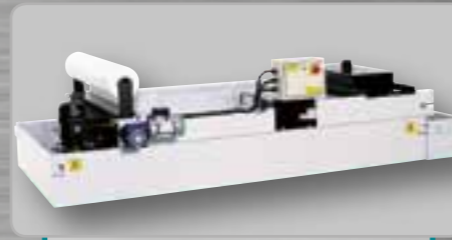
Coolant tank with automatic roller filter paper