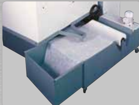
Coolant tank with paper filter