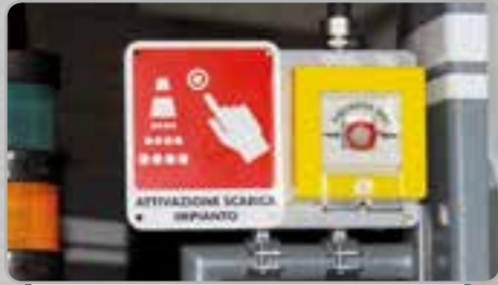
Fire extinguish system