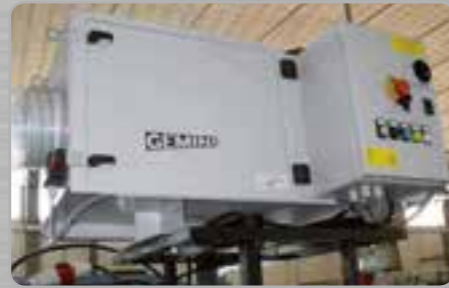
Electrostatic filtration system